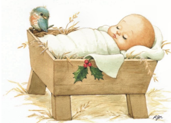
A Child is Born

Merry Christmas to you and your loved ones, from the staff of the Trinity and the Shamrock!