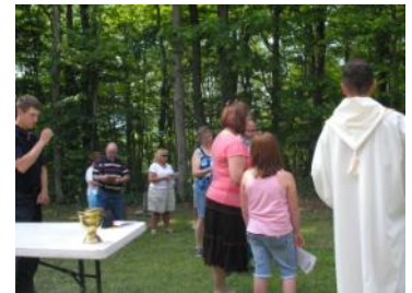
Parishioners are taking part in the blessing of the cemetery at St Colman